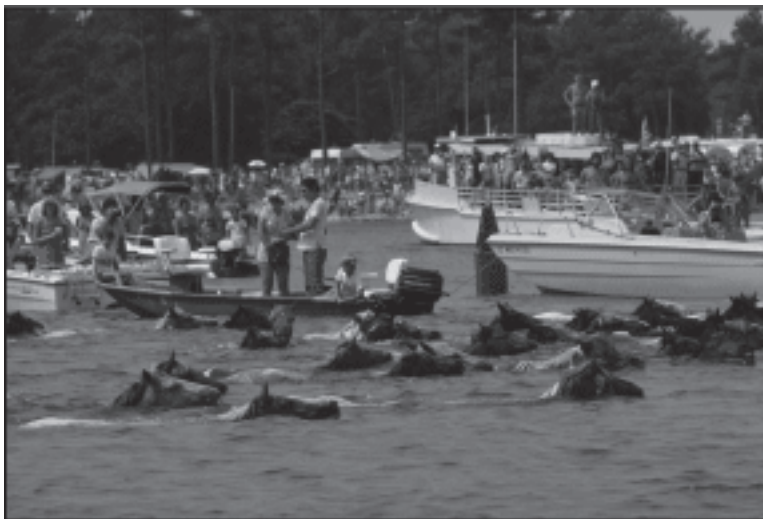
Photograph of onlookers watching ponies swimming during roundup (Image # 80995627), copyright © by James L. Amos/National Geographic/Getty Images. Used by permission.